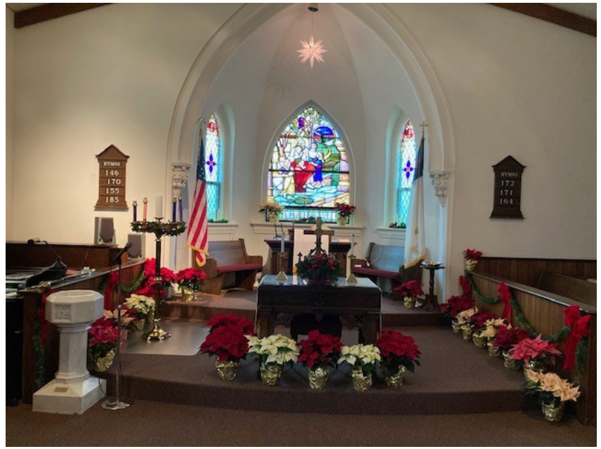
The photos are of our beautiful sanctuary decorated for Christmas with Poinsettias.

There is a new lay reader schedule on the bulletin board outside of Fellowship Hall, please sign up so we have all dates covered.