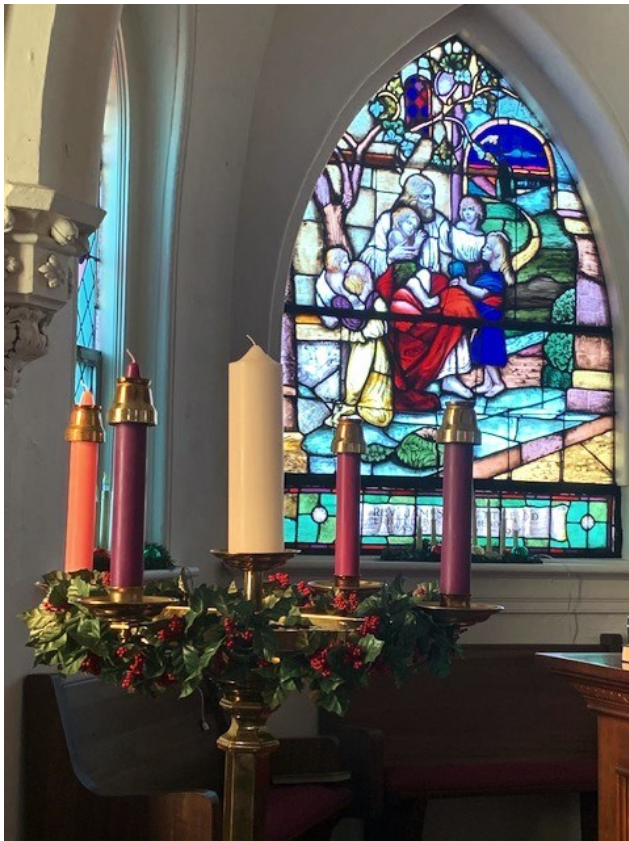
Our Advent Candles in the Sanctuary.