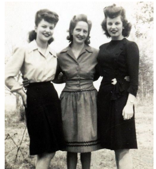
The styles 1943